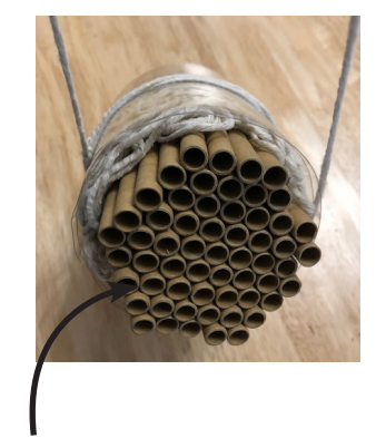
Look out for 'plugs' appearing in the tubes this means a bee has moved in!