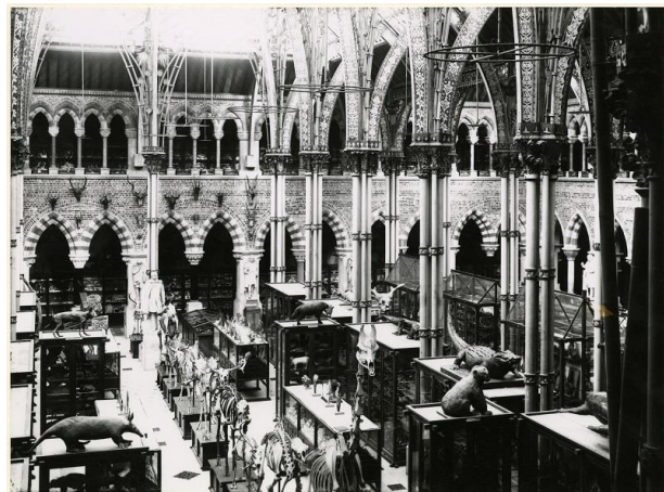
Oxford University Museum of Natural History main court in 1890

The Museum now receives more than 750,000 visitors per year, welcoming people of all ages and interests, and from all parts of the world. The redisplay programme will offer learning and enjoyment for all levels, presented in a fresh, contemporary design.