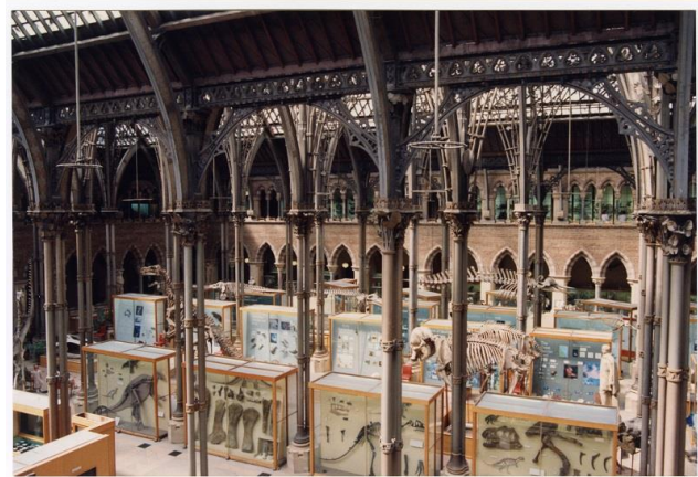
Oxford University Museum of Natural History main court, 1994

The last major redevelopment of the permanent exhibits dates from the early 2000s, when annual visitor numbers to the Museum were around 175,000, a quarter of today's figures. Over the decades since the Museum's foundation in 1860, many changes have taken place in the main court, as illustrated in photography from the Museum's Library and Archives. The original architectural design of the building was directly inspired by the rich complexity of the natural world, and under the Life, As We Know It scheme the new displays will reveal how interconnected natural processes have powered endless change over Earth's long history.