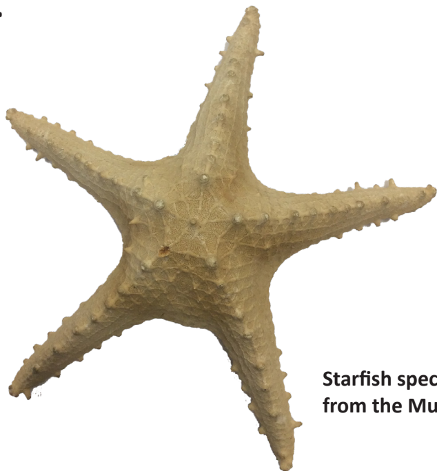
Starfish specimen from the Museum