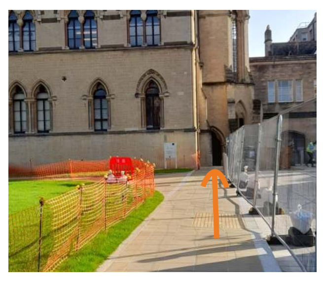
Straight on to the accessible entrance.

There are two main ways to enter the Museum from the main road. If you walk down the path on the right hand side of the building you can go through the accessible entrance if you go straight ahead. Or if you turn left you can enter via the Main Entrance doors.