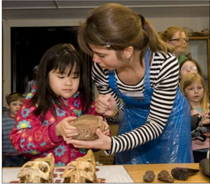
A volunteer helps a young visitor learn about dinosaurs at 'Wow!How?' 2009

The popularity of the Museum and progress in the care of its collections in recent years is in no small measure due to our growing number of dedicated volunteers. The majority help with family activities and public events, and in the past year they contributed 1,775 hours in sessions ranging from secondary school science days and half-term activities to special openings and events. One such event was 'Wow! How?', a family science fair held during National Science and Engineering Week in March. It was staffed by 92 volunteer scientists and science enthusiasts who filled the Museum with live experiments and demonstrations, attracting almost 3,000 visitors.