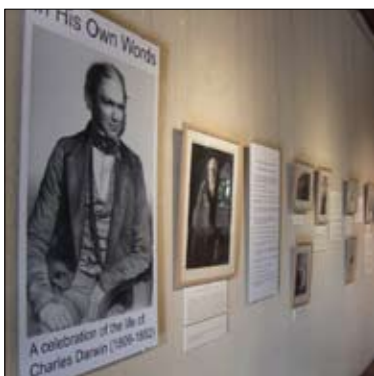
Some pictures in the Museum's exhibition.

Throughout the year, education and outreach sessions have had a Darwin theme, including family events 'Storytelling with Darwin', 'Galapagos Adventure', 'Evolution Solution' and 'What's Bugging Darwin?', a variety of schools sessions, and training events for teachers. Throughout 2009, all secondary school students visiting the Museum for science-themed visits were given a free copy of 'Darwin: a graphic biography', generously funded with a £4,000 grant from the Richard Dawkins Foundation.