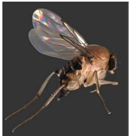
Megaselia scalaris fly photographed using the new system.