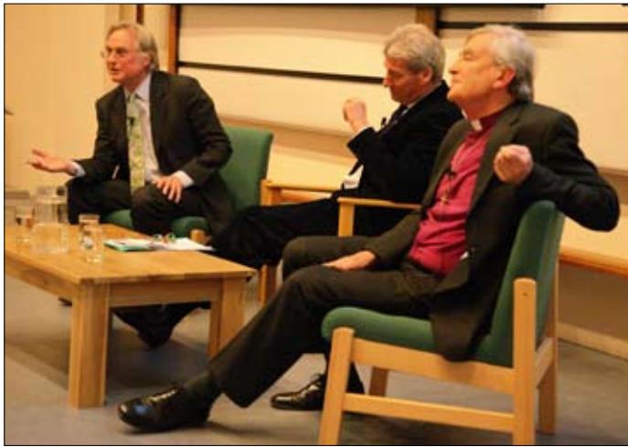
From left to right: Professor Richard Dawkins, Mr Jeremy Paxton, and Lord Harries of Pentregarth, in conversation.

Darwin's birthday was celebrated on 12 th February in a spectacular event run jointly with the Institute of Biology. It began with a performance of excerpts from Haydn's The Creation performed by Oxford Philomusica in the Sheldonian Theatre. This was followed by a conversation between Professor Richard Dawkins and Lord Harries of Pentregarth entitled 'Huxley and Wilberforce revisited'. This public debate was held in the Museum lecture theatre and mediated by Jeremy Paxman. It can be viewed at www.ox.ac.uk/itunes . A reception was followed by a dinner for invited guests, including members of the Museum's new Advisory Board.